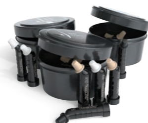
Transcend Singles 1pk 10 x 0.2 g singles