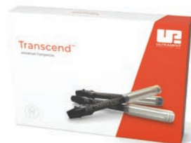
4726 - Transcend Syringe Intro Kit 1 x 4 g syringe of each shade: A1D, A2D, A3D, B1D, EN, EW, UB