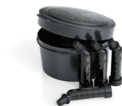
4757 - Transcend UB Singles 1pk 10 x 0.2 g singles Universal Body shade