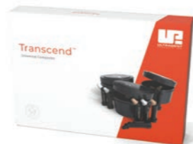
4814 - Transcend Singles Intro Kit 10 x 0.2 g singles of each shade: A1D, A2D, A3D, B1D, EN, EW, UB