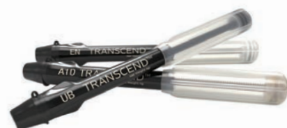
Transcend Syringe 1pk 4 g syringe